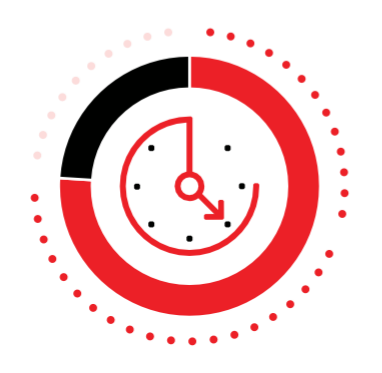
76% reduction in unplanned downtime.

Based on interviews with Ansible Automation Platform users, organizations could benefit from: